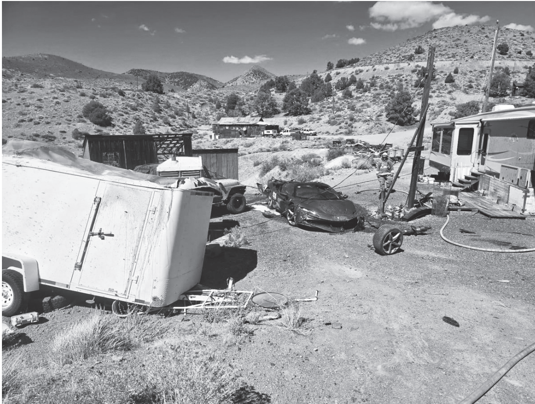
A Ferrari rolled off SR 341 during hillclimb event on Saturday, Sept. 13.

The annual Virginia City Hillclimb, hosted by Ferrari Club of America-Southwest Region, raced up Nevada SR 341 on Sept. 13-14. The 5.2-mile course up the Occidental Grade truck route gains more than 1,200 feet in elevation and features 21 curves and technical turns. While the road is manageable at the posted 25-35 mph speed limits, doubling or tripling that speed turns the course into a true test of skill, reaction time, and – at times – luck.