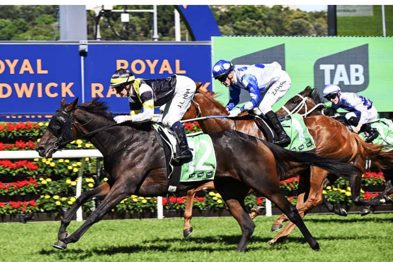
Good Banter winning the Gr.3 Adrian Knox Stakes (2000m) at Randwick on Saturday.