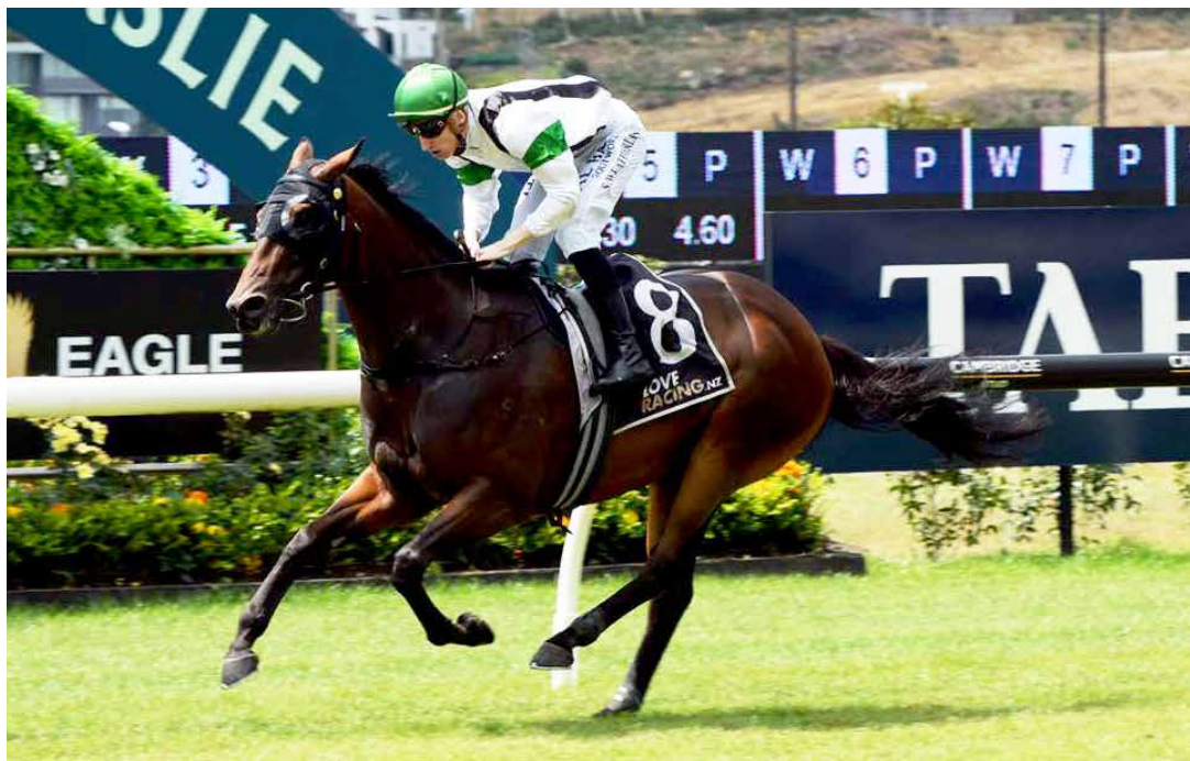
Rudyard won his fourth race of the season at Pukekohe on Saturday.