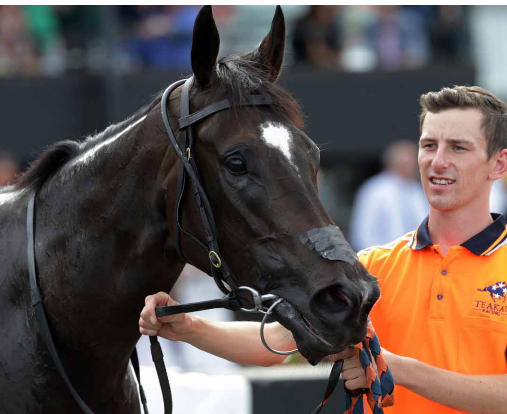
Imperatriz is on her way back to New Zealand for a well deserved break.

"We'll have everything open for next season."