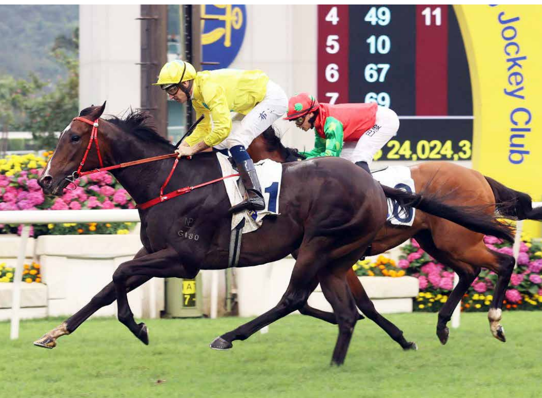
Lucky Sweynesse winning the Gr.2 Sprint Cup at Sha Tin on Sunday.