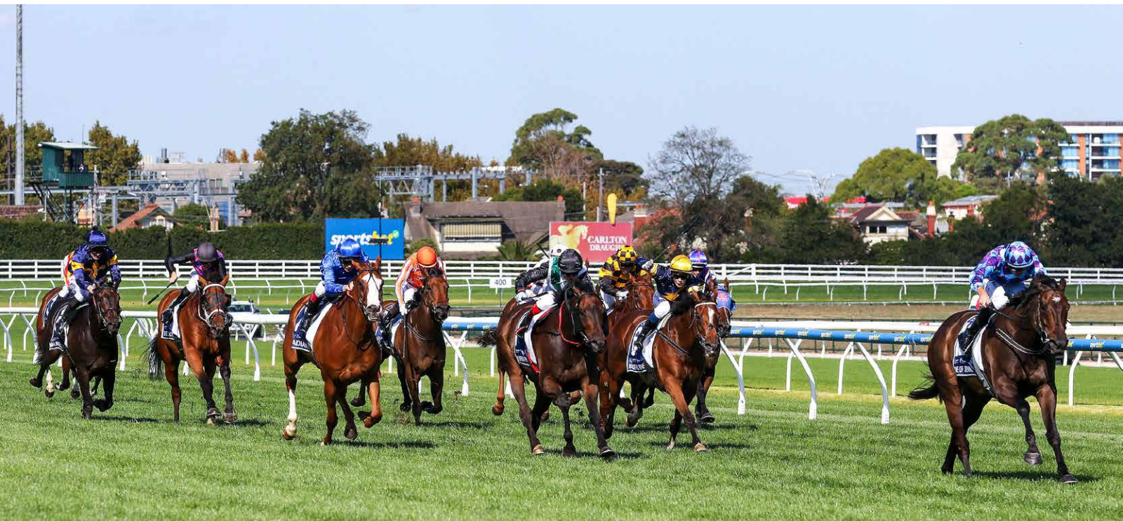
Star mare Pride Of Jenni gaps the field in the All-Star Mile (1600m)