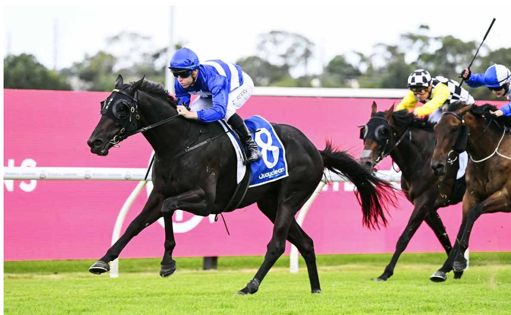
Exciting Savabeel three-year-old Wymark runs out a strong winner at Rosehill.