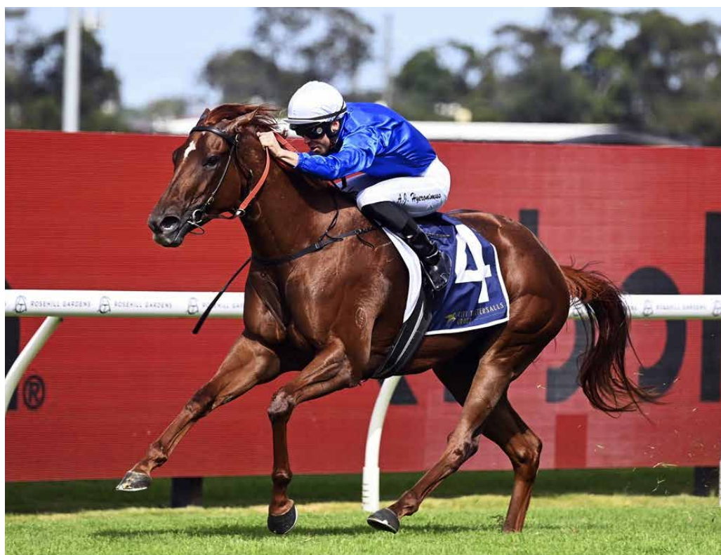
Gr.3 Maurice McCarten Stakes (1100m) winner Red Card