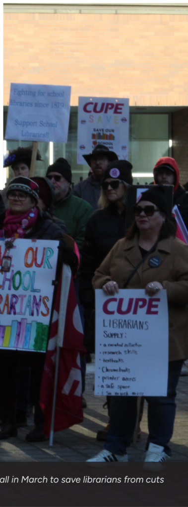
caption People at a rally outside of city hall in March to save librarians from cuts