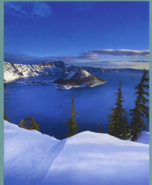
This issue's cover photograph is of our beautiful Crater Lake National Park in Southern Oregon.