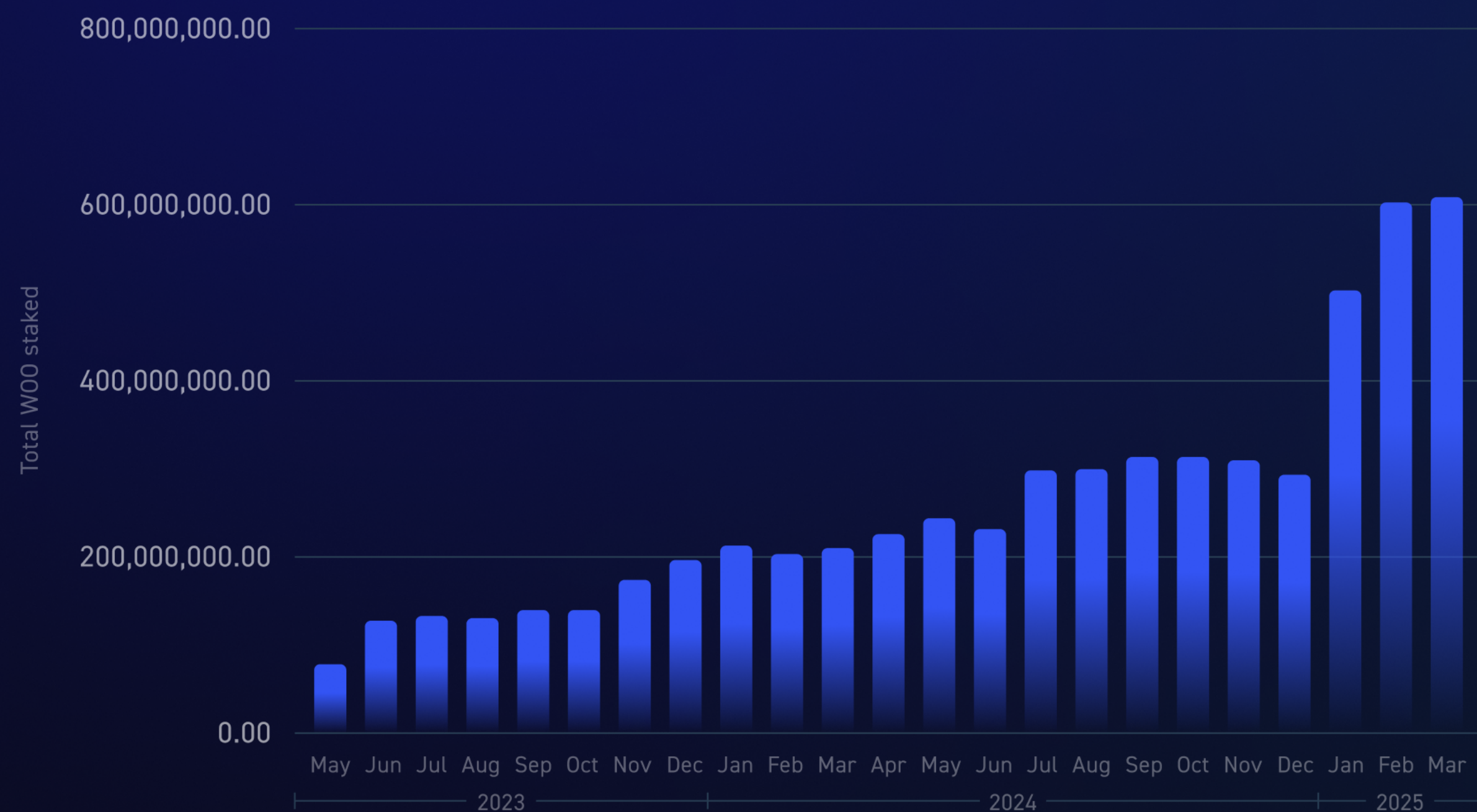
WOO staked on all chains