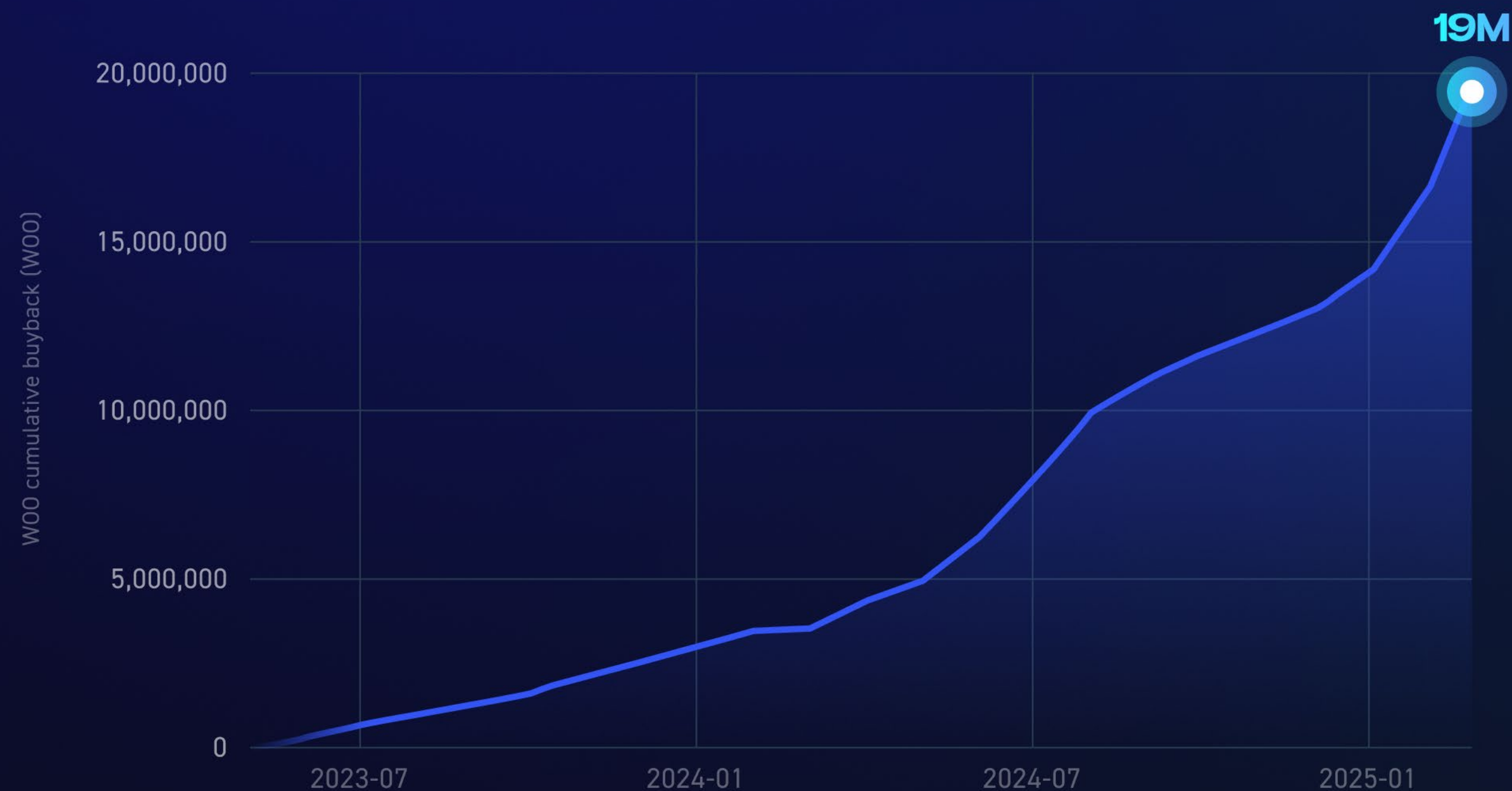
WOO cumulative buyback ($WOO)

Foundation treasury wallet matched and burned 6.7m WOO in Q1