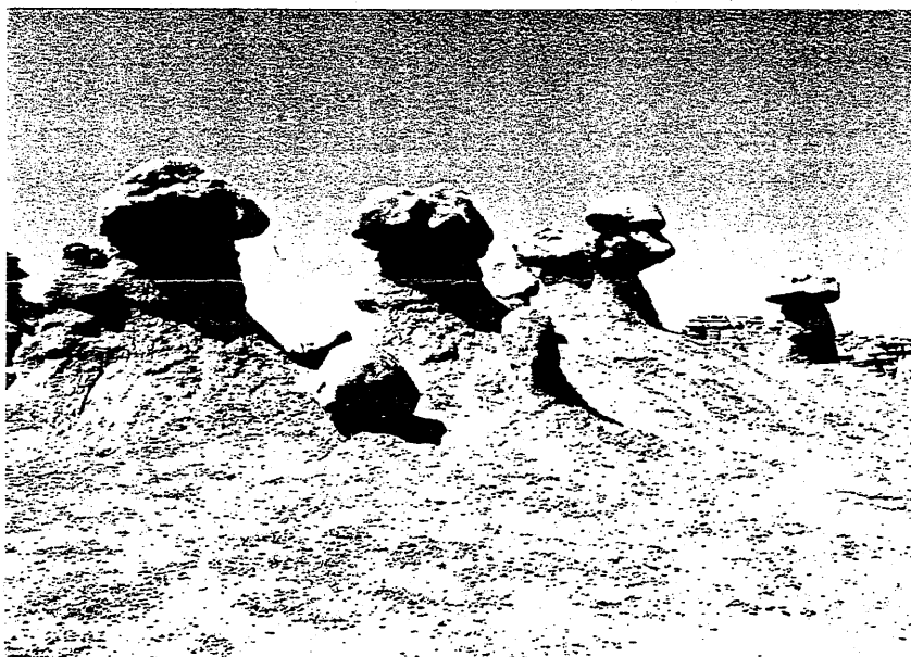
Goblin Valley, Utah

The meeting will be on February 11 th at 7:00 PM in the second floor meeting room of the Courthouse Annex, room #201. Use the Pine Street entrance. Rocky Mountaineers monthly meetings are free and open to all. Interested persons are welcome to stay and ask questions or to take a