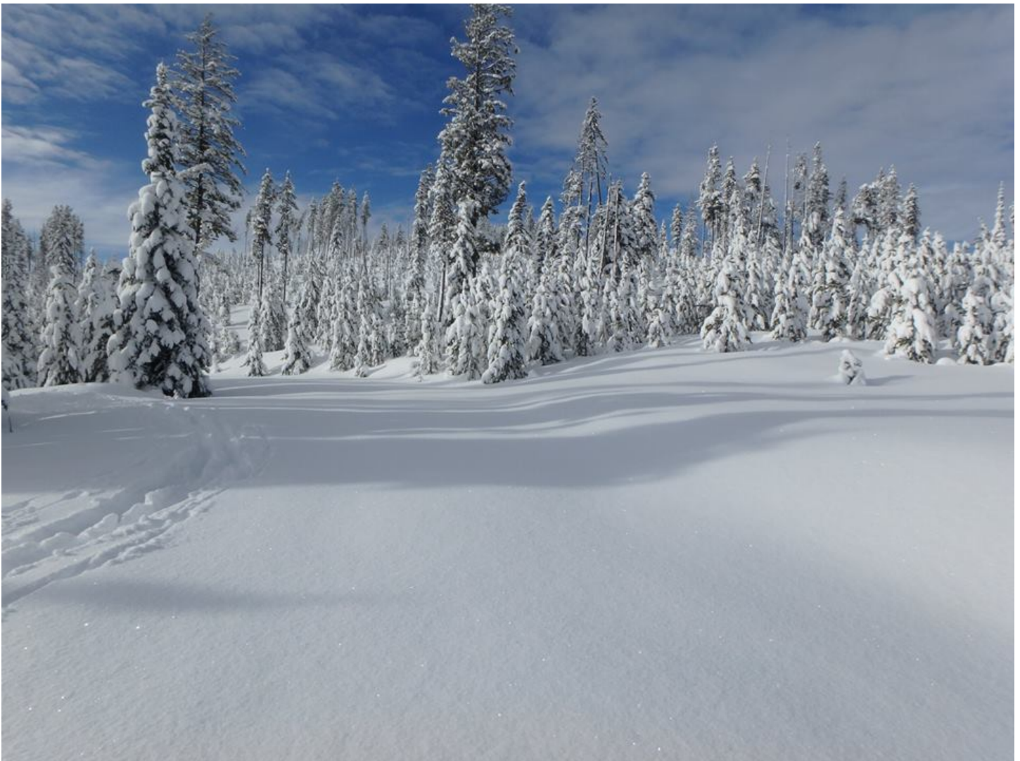
Fresh snow, light, and shadow.