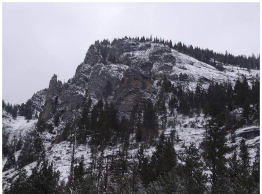
Crags above Bear Creek.