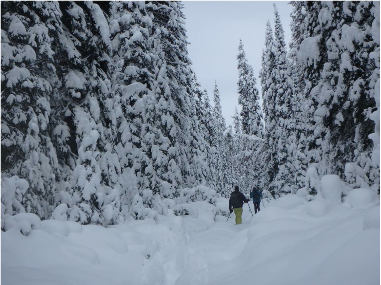
The snow's getting deep up there now.....