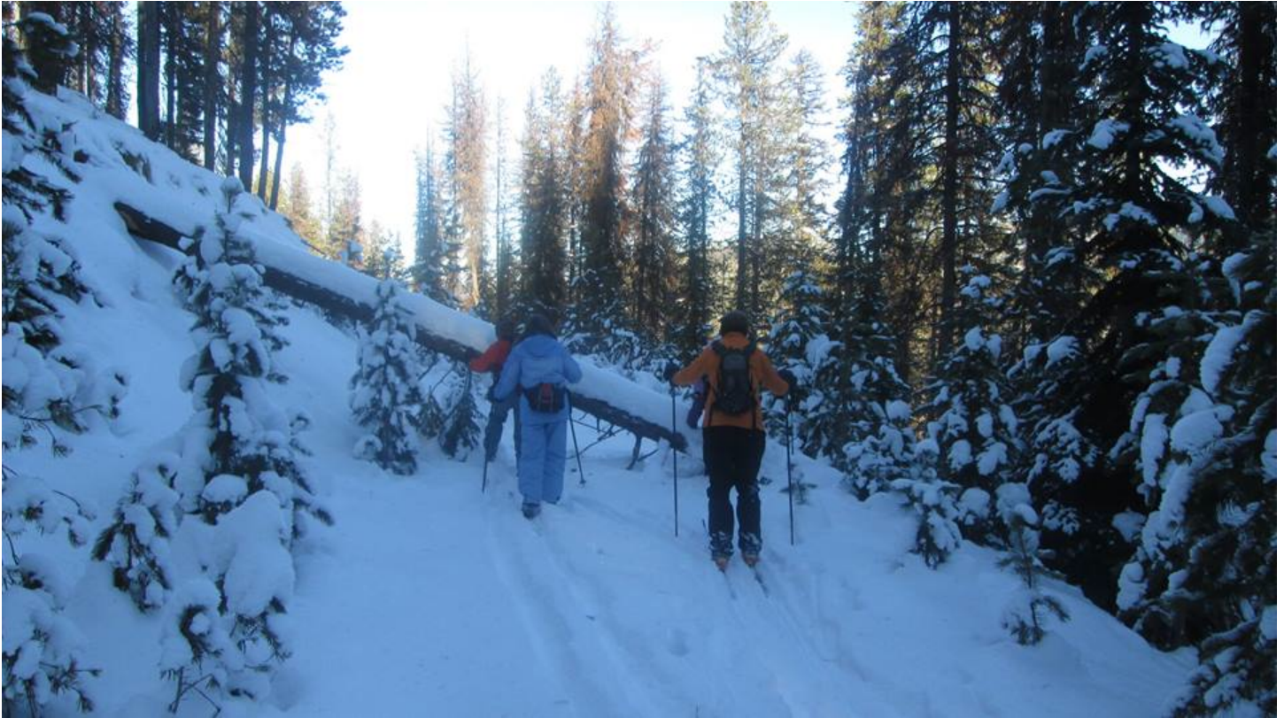
Some obstacles.....