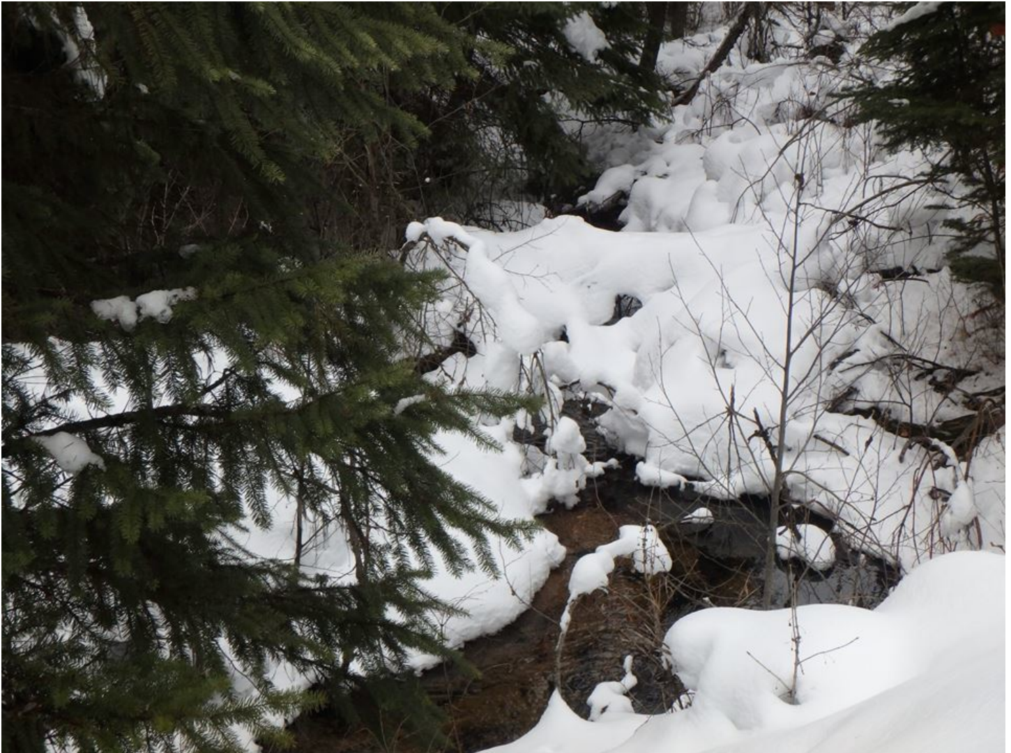
Lee Creek by the campground.